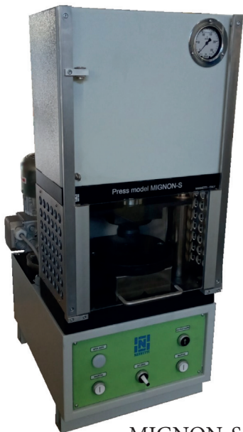
MIGNON-S [20 TON]