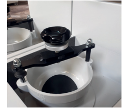
Jar holder cup made of a single piece of casting