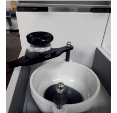
the jar-locking arm is mounted on a spring mechanism to make it quick to replace the jar itself

The machine is built and supplied with modular modules (heads), mounted on a single frame.